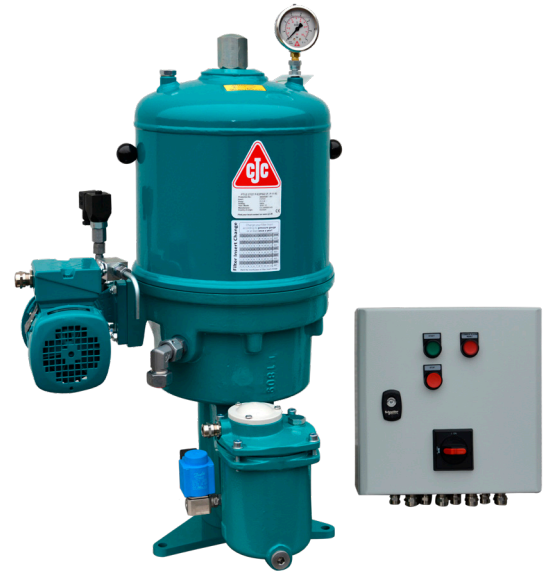
The CJC® Filter Separator PTU2 27/27 PVM for hydraulic, turbine lube & gear oils with flexible control box